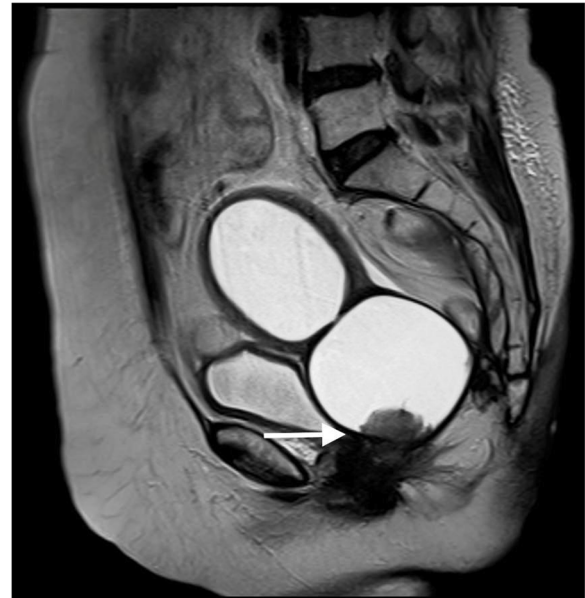
Fig. 4 Sagittal T2-weighted image demonstrates increased T2 signal intensity representing water, filling endometrial and vaginal lumen secondary to obstruction of metastatic lesion (arrow) at the vaginal lumen distally