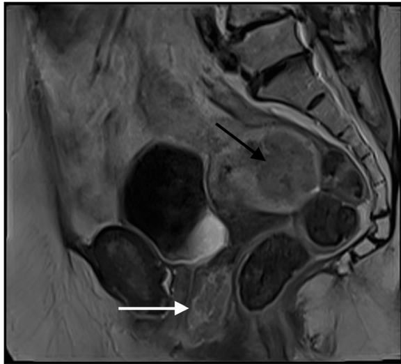
Fig. 1 Sagittal T1-weighted image obtained after administration of contrast material demonstrates endometrial mass (black arrow) with heterogeneously enhanced vaginal metastasis (white arrow)